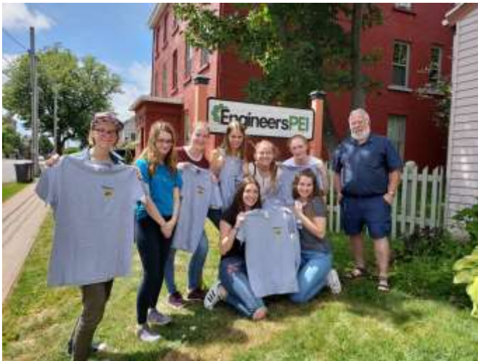
Grades 11 and 12 high school students participating in ProGRES (Promoting Girls in Research in Engineering and Sustainability) 2018 on a lunch visit to Engineers PEI