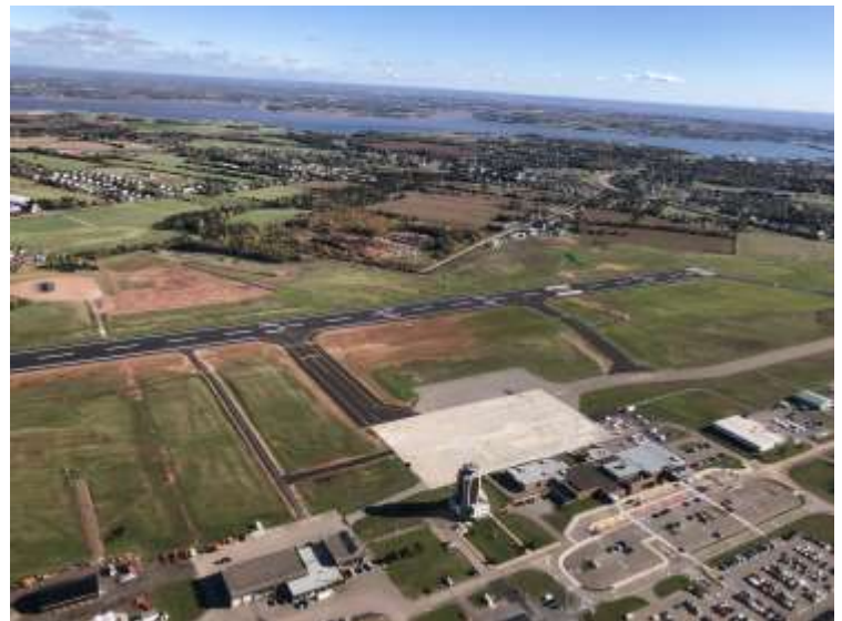
Charlottetown Airport Runway Rehabilitation Project

Professional Engineers in order that the public interest may be served and protected.