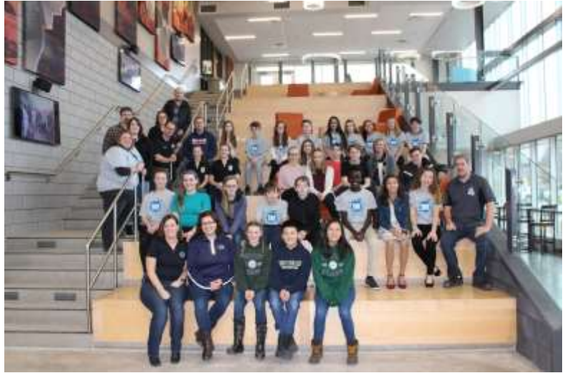
Future City Competition Participants